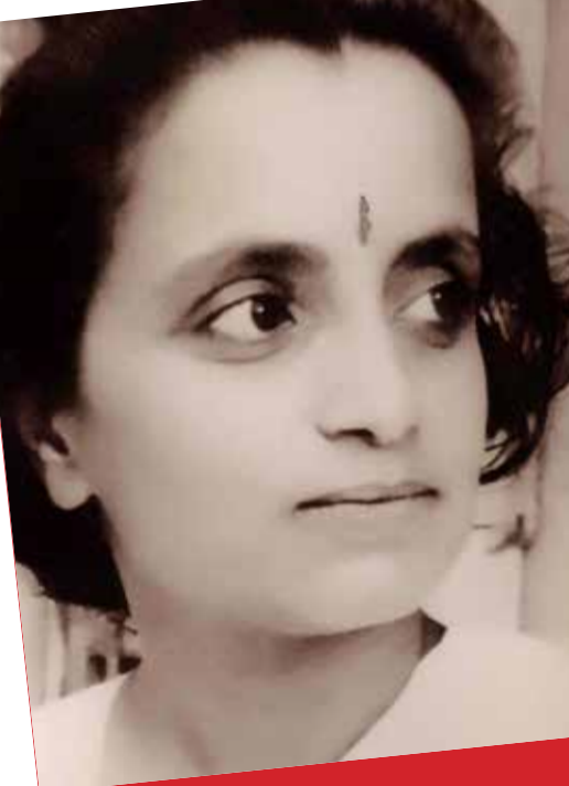
Germany 2020 110 min / OV

This film is an ode to the power of silence, a song of devotion, a dance with dignity. A fiery contemplation on our responsibilities It is a love poem inspired by a noble Indian woman and her rebellious spiritual life.